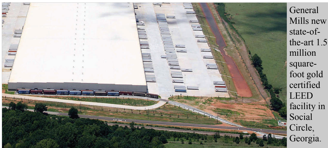
General Mills new state-of-the-art 1.5 million square-foot gold certified LEED facility in Social Circle, Georgia.

Partnering with rural and low- and moderate-income communities to provide innovative ways to replace jobs lost from the decline of traditional industries