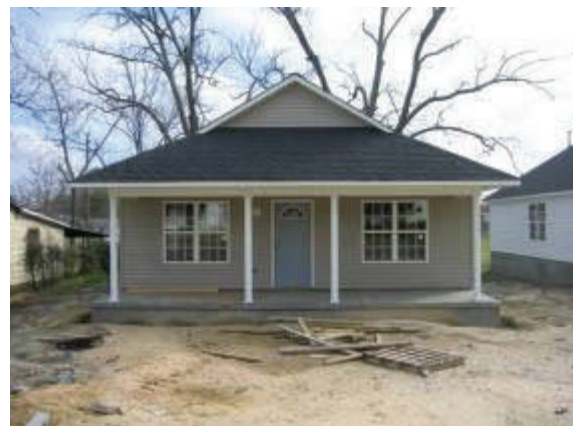
Same parcel of land before and after its redevelopment—Fitzgerald, Georgia

The State CDBG Program in conjunction with the Georgia Redevelopment Law (O.C.G.A. 36-61) is the major component of these successful initiatives. The City used CDBG funds to purchase blighted properties, clear or rehabilitate the dilapidated structures, re-plot the lots, and then sell the units to the low-income families. Families finance their new homes with private mortgages from a consortium of local banks.