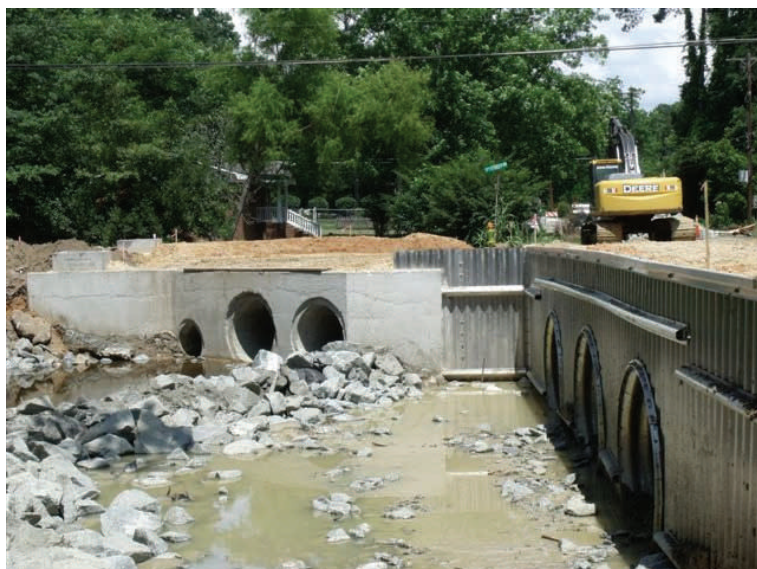
CDBG improvements keep flood waters out of homes in the Sixth Avenue neighborhood of Cairo, Georgia.

The State's program combines local investments with CDBG to finance infrastructure that provides public water to replace contaminated wells, public sewer to remove raw sewage in families' yards, and drainage improvements to keep floods out of neighborhoods.