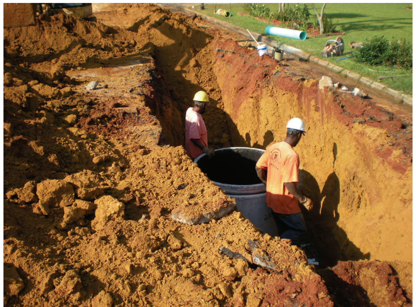
CDBG funds routinely put people to work in rural Georgia as shown in this photograph of sewer construction work in Blakely, Georgia.

– Ronald Reagan, Executive Order 12612, 1987.