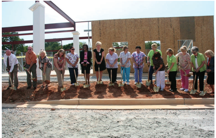
Groundbreaking ceremony for the new Coweta County Health Department Building—made possible by CDBG and the contribution of over $1.8 million in local funds.

As outlined in the examples that follow, the State CDBG Program is playing a pivotal role in providing the seed capital and leveraging of private funds needed for these communities to create and implement their own local solutions.